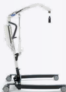
Birdie EVO COMPACT

A redesigned version of the market leading Birdie mobile floor lifter, designed to support safe transfers in both home-care and long-term-care environments.