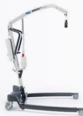
Birdie EVO PLUS

A smaller size allows the Birdie EVO COMPACT to easily operate in environments where space is limited.