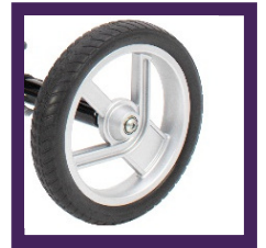
10" Front Castor