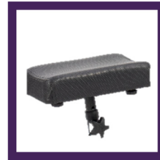
Adjustable knee pad 31x17cm